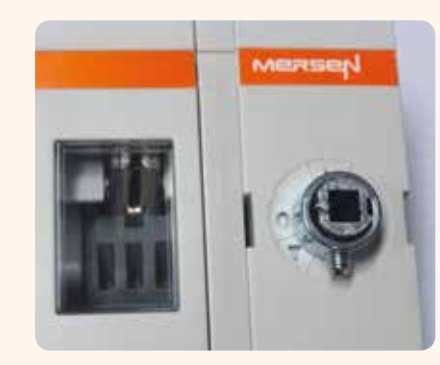
Safety: Window provides visible verification of position of switch.

• Safety: Harmless time for operating personnel, visible contact