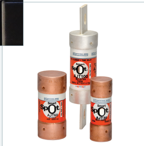
Class J Fuses