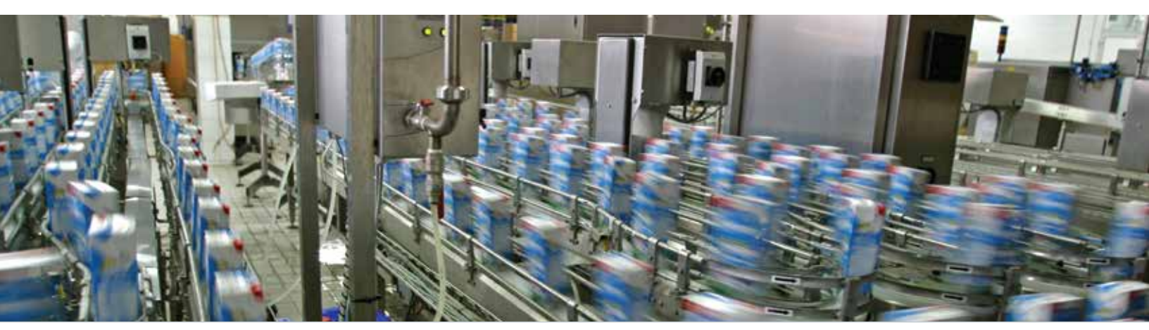
FLY-Knowledge-Center-001 | 7.19 | PDF | ©Mersen 2019. All Rights Reserved.

Learn about the main components of a typical photovoltaic installation, understand the different segmentations of the solar market, and identify Mersen fuses and fuses holders designed for use in PV installations.