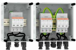
PV SPD T2