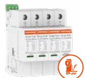
SPD T2+3 EV