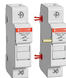
UltraSafe fuse holder with USPTH Pin-Ties