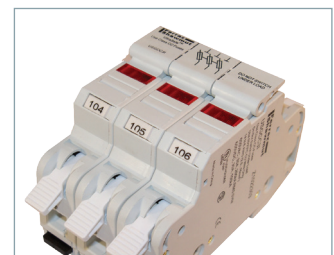
WMB Marker System